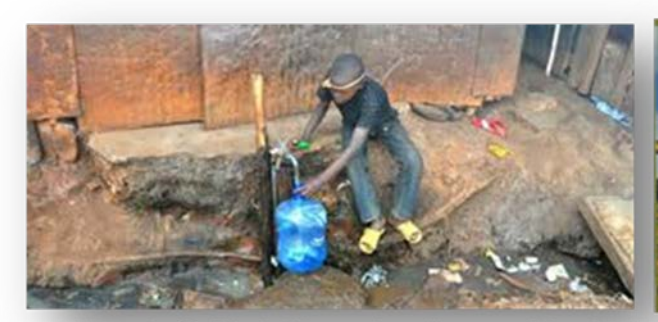
Figure 2: Quality of basic infrastructure in comparative perspetive

Mushin Local Government, Lagos State Nigeria. Bantry Bay suburb, Cape Town, South Africa.