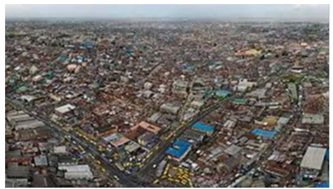
Figure 1: Infrastructure as a social good.