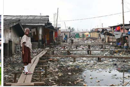
1. Roads in Johannesburg South Africa. 2. Roads in a township in South Africa. 3. Roads in a squatter settlement in Nigeria.