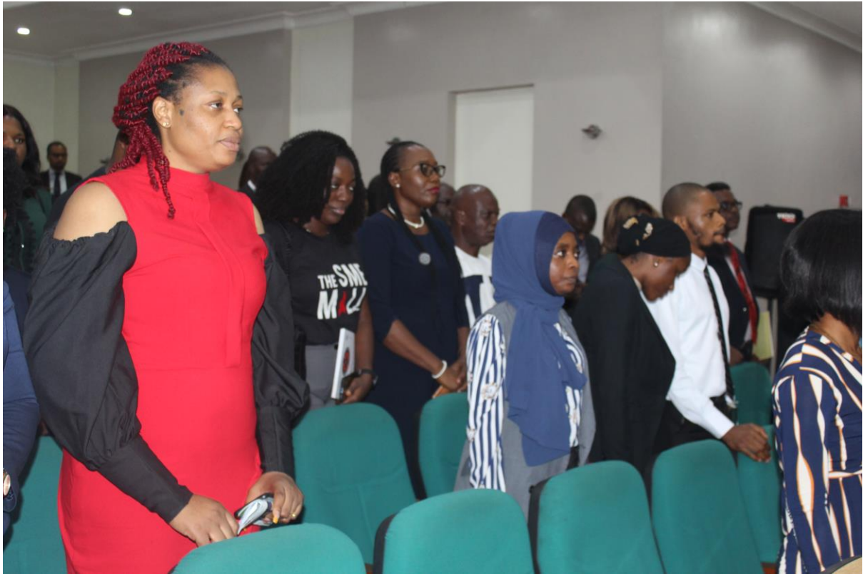
PHOTOS FROM THE “RESILIENCE LEADERSHIP: STRATEGIES FOR ENHANCING CORPORATE PERFORMANCE” TRAINING WHICH HELD ON WEDNESDAY, DECEMBER 7, 2022 AT THE GEORGE HOTEL, LUGARD AVE, IKOYI , LAGOS